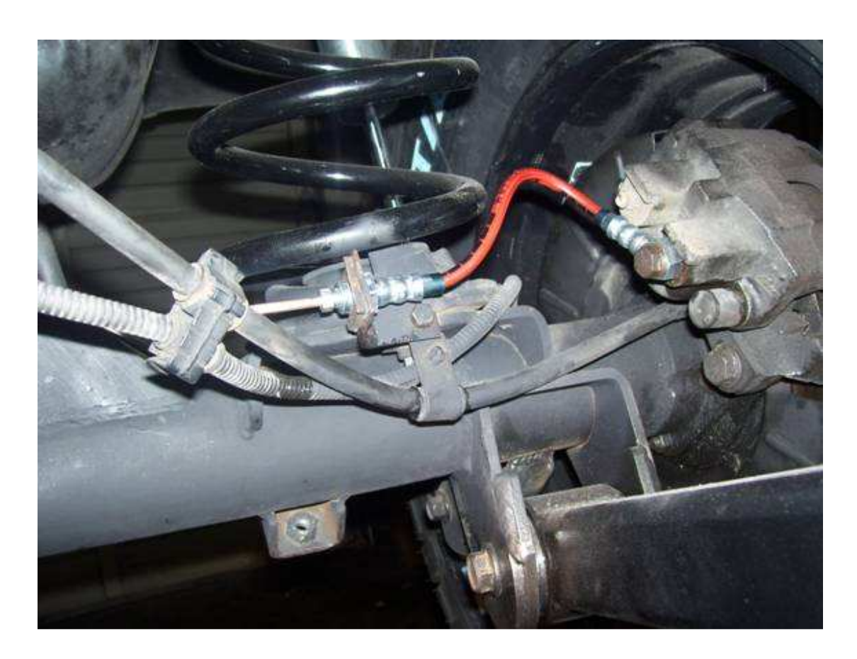
* Pictures shows Brake line, E-brake cable, And ABS sensor wire routing.

Picture shows metal spacer installed with longer supplied bolt.