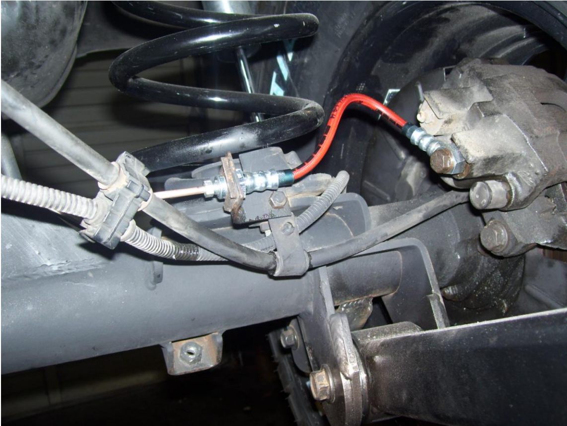
* Pictures shows Brake line, E-brake cable, And ABS sensor wire routing.